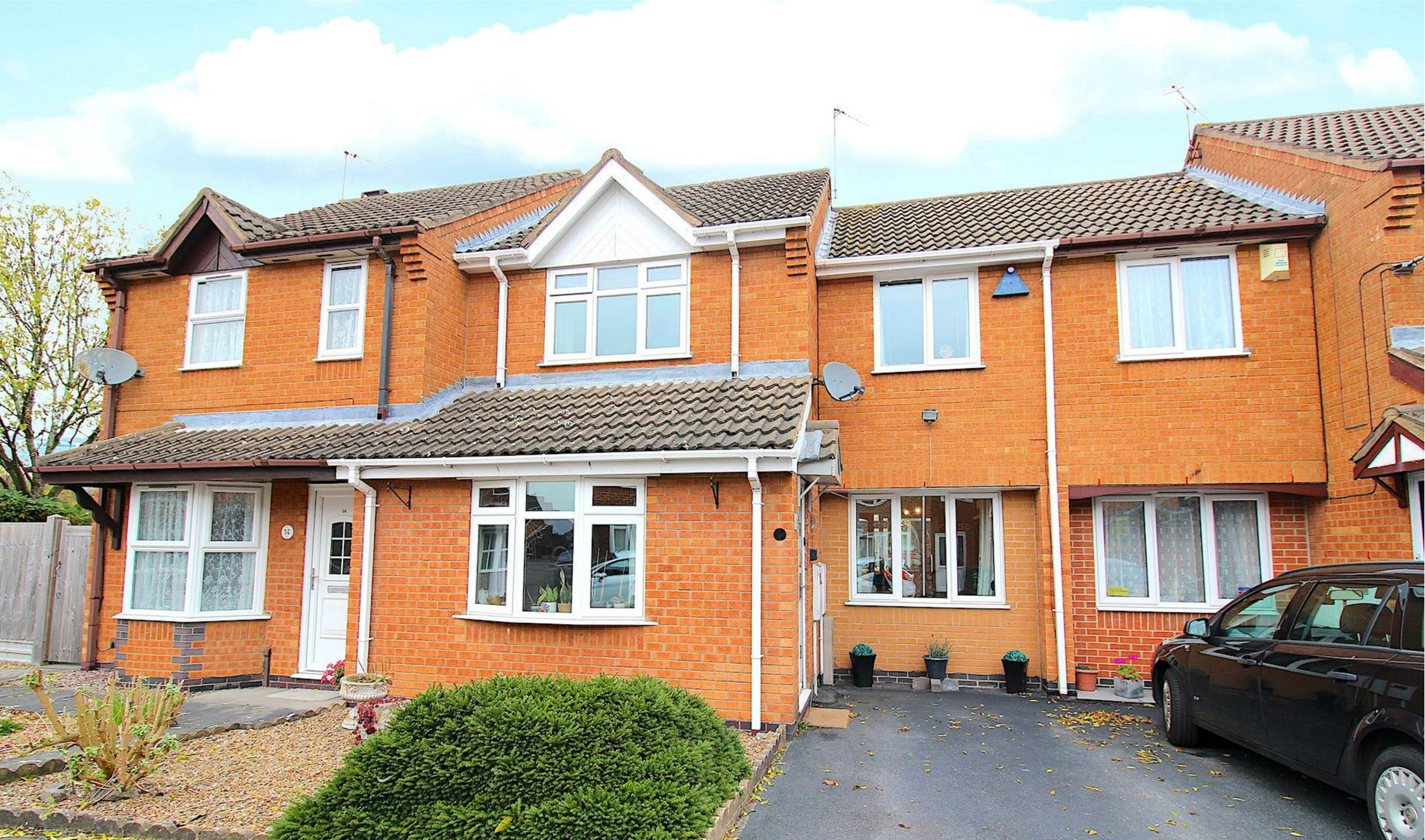
Curlew Close, Syston Leicester, Leicestershire, LE7 1XA